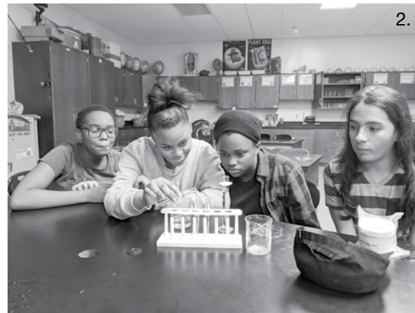
2. Carefully pouring the contents of one test tube into another, the I-Prep students get their experiment ready.