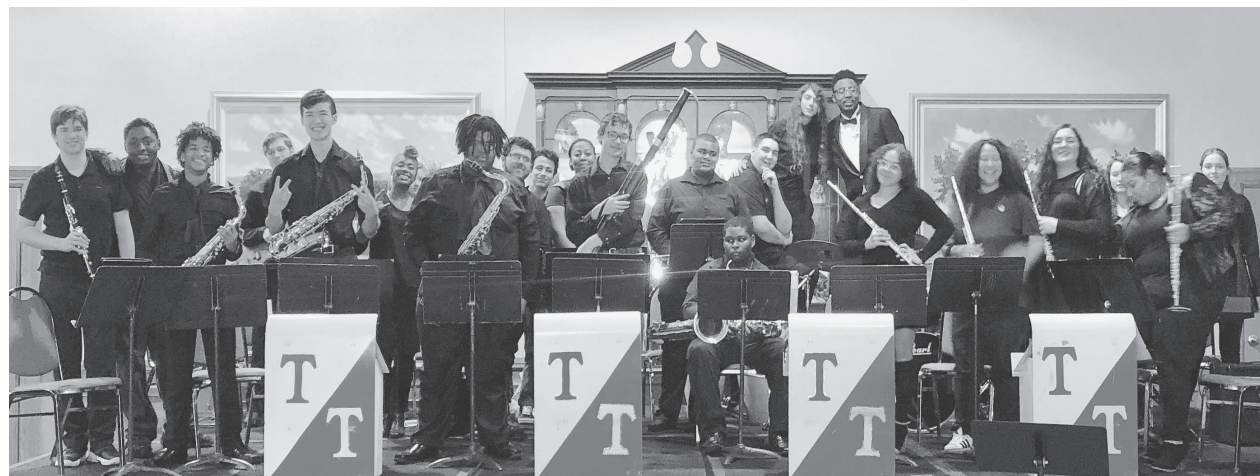
Hutch Tech Band