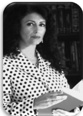
If you love someone, set them free .....with kindness

For more information, or to join the organization, visit schoolhousedems@gmail.com