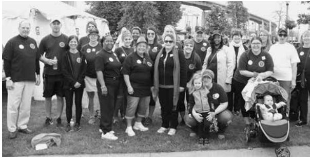
Walkers representing the BTF