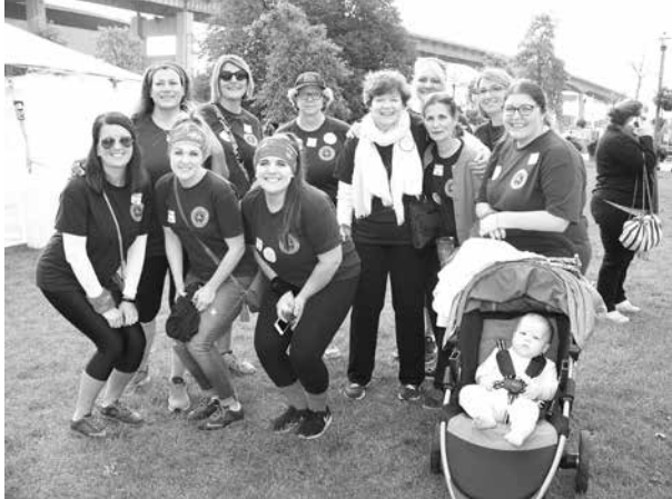
Walkers from Southside Elementary