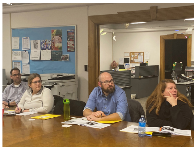
1. The participants of the December 7th training pose for a photo at the conclusion of When the Principal Calls .