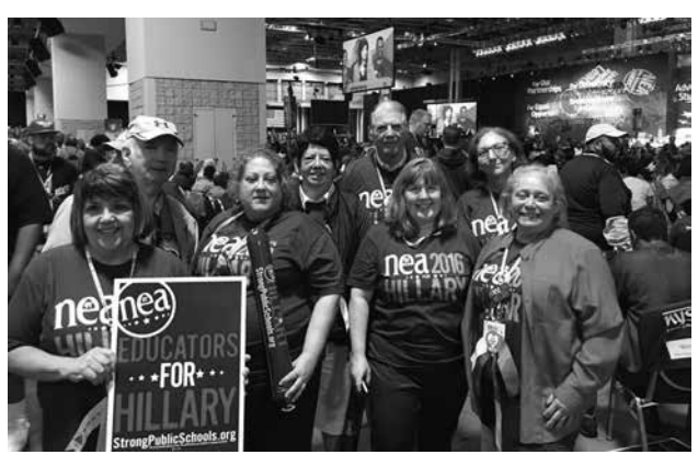
Buffalo delegation at NEA RA